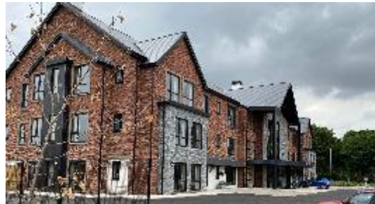
Worcester Care Home Completed: 2020