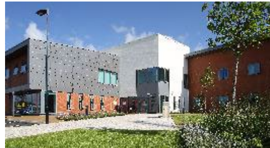
St John's Medical Centre Completed: 2016