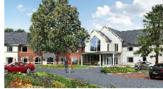
Hereford Care Home Completed: 2018