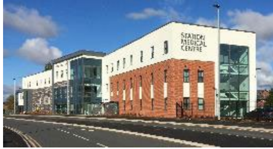
Hereford Medical Centre Completed: 2021